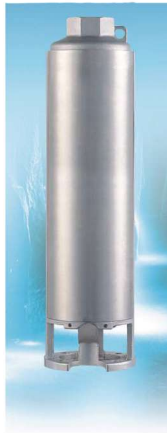
TABLA DE SELECCION